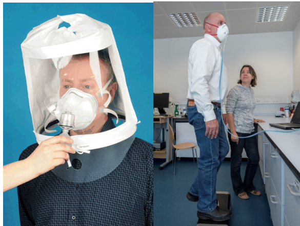
Figure 6 Qualitative and Quantitative fit testing

Where there is exposure to RCS, the RPE selected should be of a type which gives protection at least equivalent to that of an FFP3 respirator. However, the actual device selected will depend upon the nature of the task, the environment and the wearer (In some case a higher degree of protection may be required). In some MS a fit test is required for a tight-fitting mask, to check it matches the wearer's face and seals adequately. The fit test may be qualitative (based on the wearer's subjective assessment by sensing a test agent), or quantitative (measured using specialised equipment) (See Figure 6). Workers must be clean-shaven to get an effective seal to the face with a tight-fitting mask. Long hair or other facial features can interfere with the seal. The RPE equipment must be CE marked to ensure it has met the minimum legal requirements for its design.