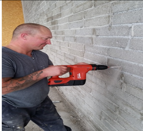
Poor practice – Using Hand-held drill with no on-tool extraction (David Flynn Ltd, IE)