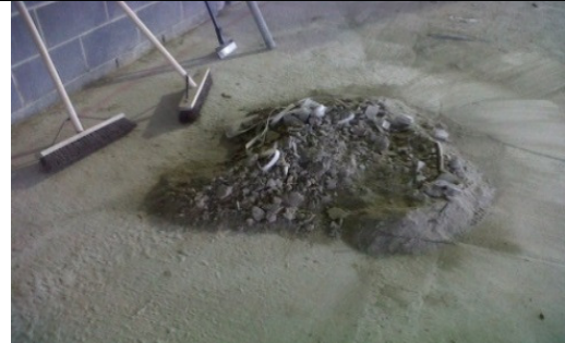
Poor Practice – Removal of rubble using dry sweeping (HSE, GB)