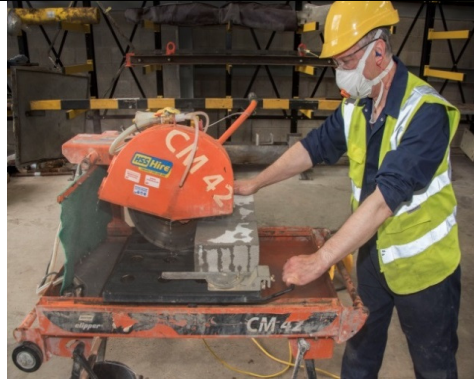
Good practice – Use of water suppression (shown) and RPE worn by the operator (HSE, GB)