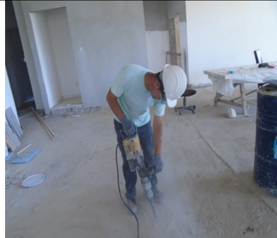
Poor Practice – Using a hand-held breaker without on-tool extraction (DLI, CY)