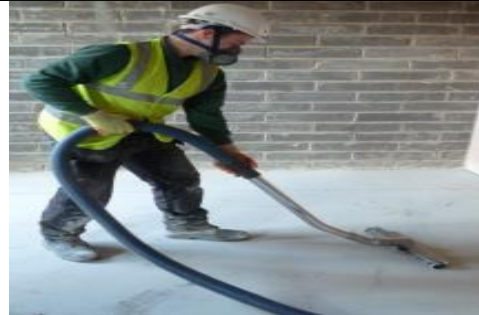
Good practice – Removal of dust using high-efficiency filter vacuum (HSE, GB)