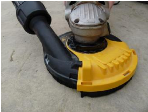
Figure 3 Grinder with on-tool extraction

The captor hood is the most important part of the LEV system (See Figure 3). It is often manufactured as part of the power tool but it can also be retro-fitted to existing equipment. Poor design of, or damage to, the hood, will significantly affect the control of dust.