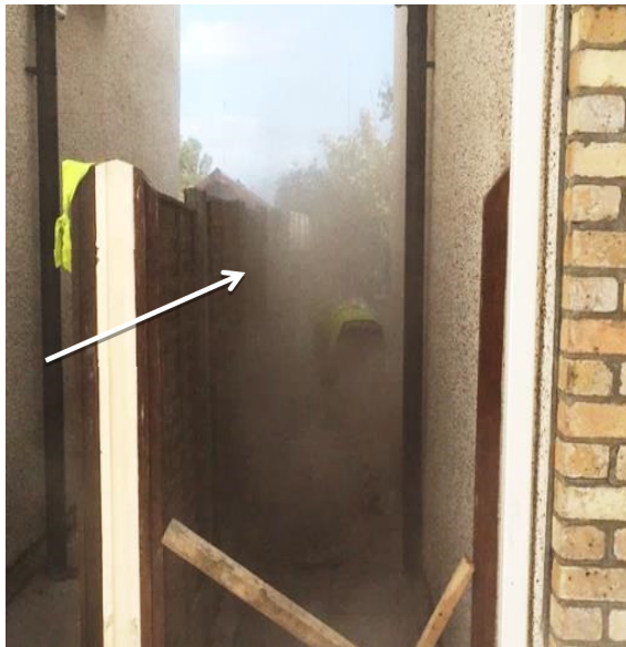
Figure 1: Worker at risk of high RCS exposure. Arrow points to worker

Workers exposed to RCS are also at an increased risk of tuberculosis, kidney disease, cardiovascular diseases 4 and diseases of the immune system such as scleroderma, rheumatoid arthritis and systemic lupus erythematosus; although these are quite uncommon.