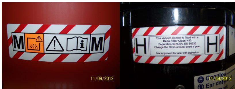
Figure 4 Label on M and H class extraction units

The extraction unit is like an industrial vacuum. It is a portable unit and also an important part of the LEV system. The extraction unit removes the dust from the captor hood, filters it and then stores it for safe disposal. It is important that the extraction unit is to the correct specification for silica i.e. M (Medium) or H (High) class unit. The extraction units are marked with a special label (see Figure 4 below).