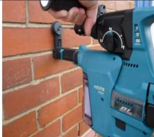
Good practice – Using a hand-held drill with integrated cassette (HSE, GB)