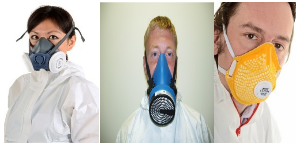
Figure 5 Re-usable half-mask respirators and FFP3

Respirators (filtering devices) are available in a range of styles, either as tight-fitting face-pieces (masks) or loose-fitting face-pieces (hoods/helmets). Disposable and re-usable half-mask respirators (both tight-fitting devices) are generally used on construction sites (See Figure 5). Powered hoods/helmets and full-face respirators may also be worn occasionally. Air-line blasting helmets should be worn for abrasive grit blasting.