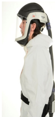
Figure 7 Powered helmet

Options such as Helmets/Hoods which are not tight-fitting (and do not require a fit test) are available for workers who have beards or are unable to obtain an adequate fit with other mask types. Models incorporating head and eye protection can also be selected. These should have a TH2 classification. (See Table 2 and Fig 7).