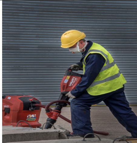
Good practice – Using a hand-held breaker with on-tool extraction (HSE, GB)