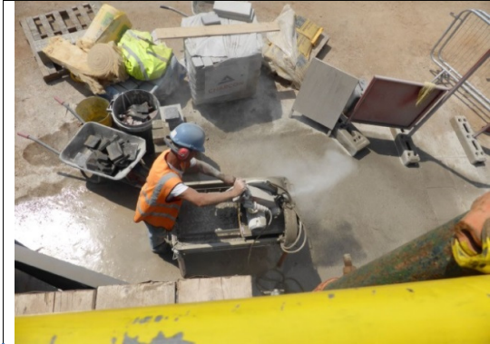
Poor Practice – No/insufficient water suppression and lack of RPE (HSE, GB)