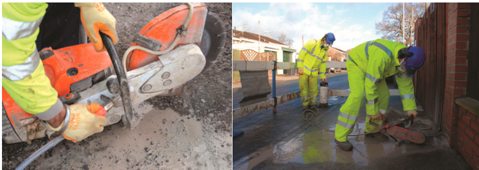
Figure 2 photographs showing water suppression system: (source HSE, GB)

During a site inspection, appropriate action taken by the inspector should be considered, in line with their national legislation and regulatory framework, if the following is observed: