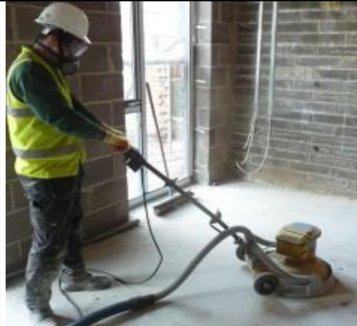
Good practice – sanding concrete floors with on-tool extraction (HSE, GB)