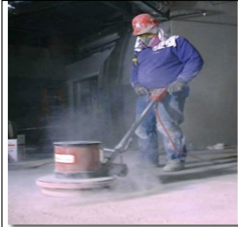
Poor Practice – sanding concrete floors without on-tool extraction (GDWW, B)