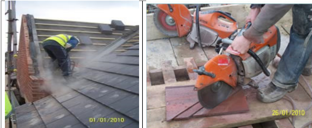
Poor Practice – Cutting roof tiles without control measures (National Federation of Roofing Contractors Ltd, GB)